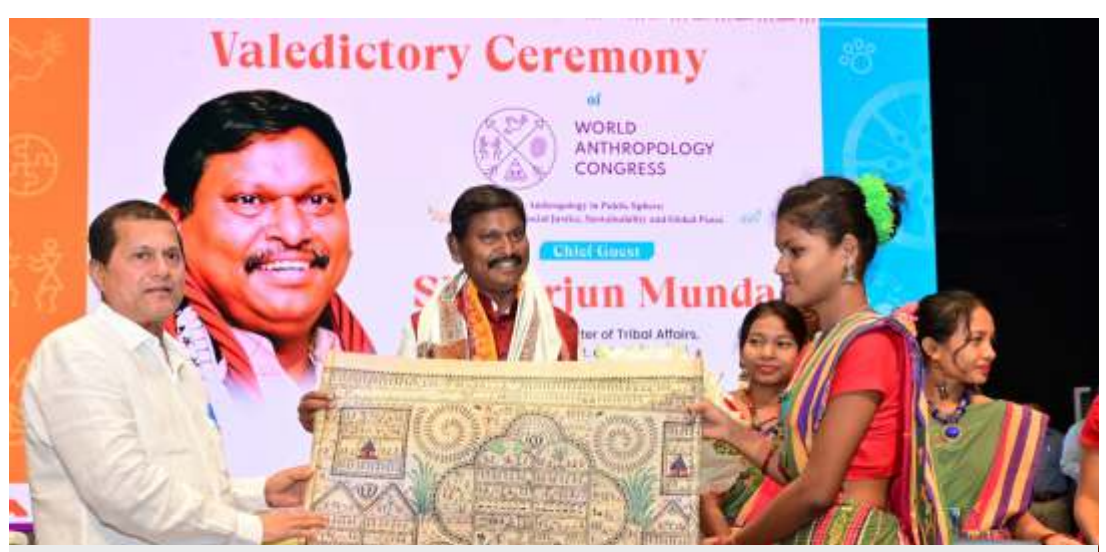
Prof. Achyuta Samanta, Founder, KIIT & KISS felicitating Shri Arjun Munda, Hon'ble Union Minister of Tribal Affairs at the closing ceremony of the World Anthropology Congress 2023.