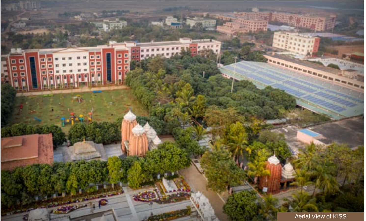
Aerial View of KISS