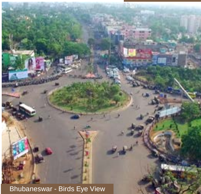
Bhubaneswar - Birds Eye View

The culturally rich capital of Odisha Bhubaneswar was established in 1948 but its history can be traced to the 3rd century BCE and even earlier. It is a confluence of Hindu, Buddhist, and Jain religious ideologies. Its heritage boasts of some of the finest Kalingan temple architectural and infrastructural splendor, besides the lush verdant canopy of its forests. It is the anthropologists' paradise visually, culturally, and academically.