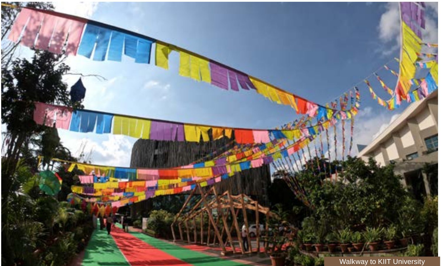
Walkway to KIIT University