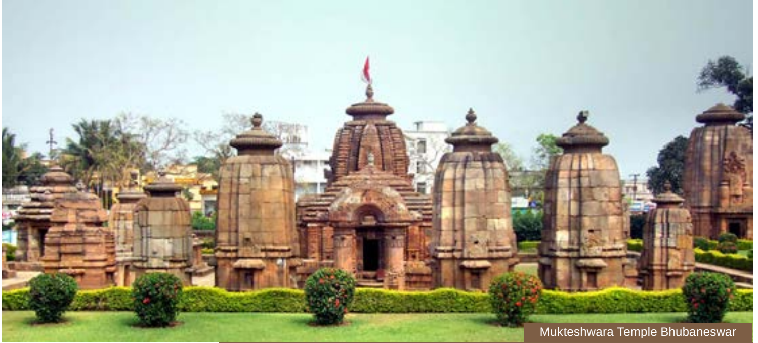
Mukteshvara Temple Bhubaneswar