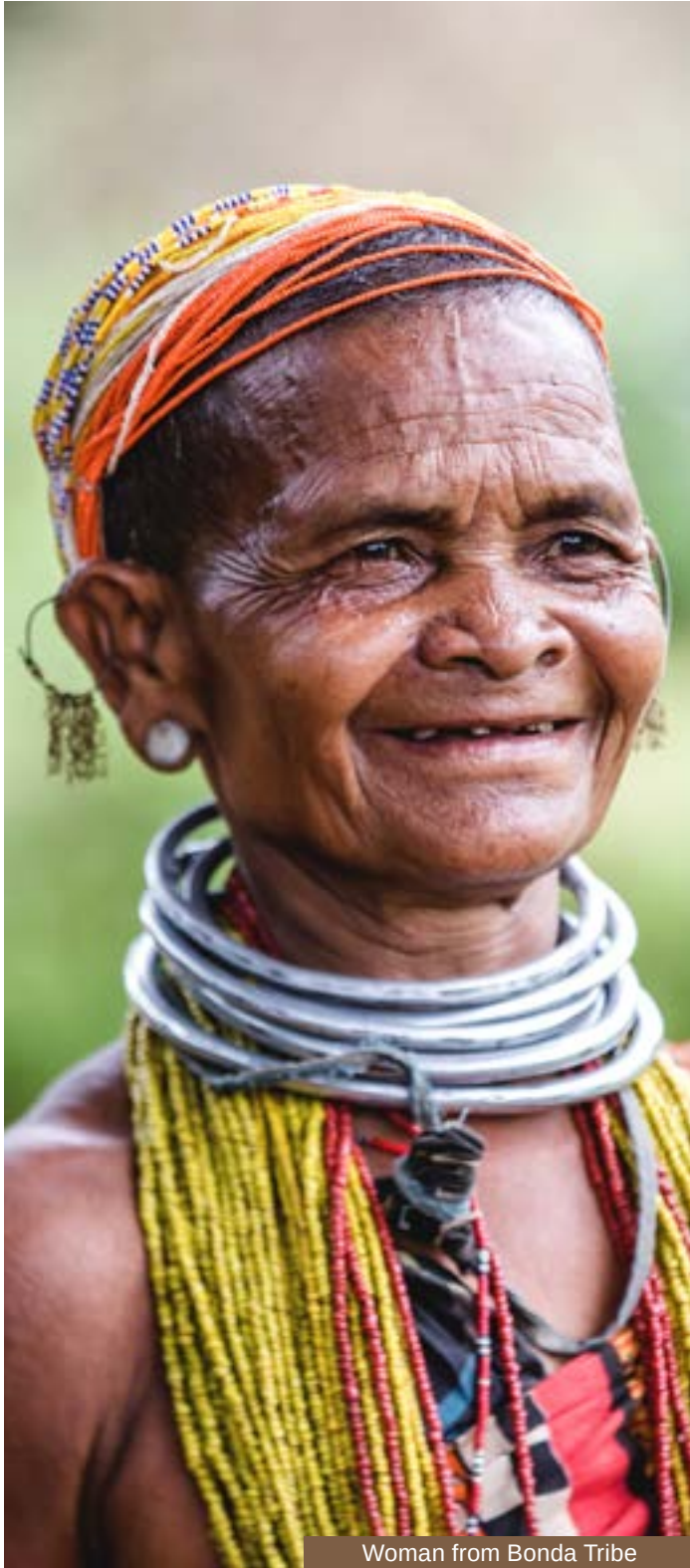
Woman from Bonda Tribe